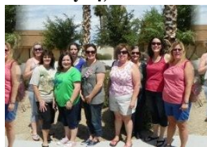
FB Church Ladies head to retreat. September 2011.